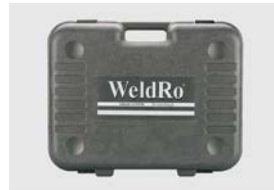
Magnetic Drilling Box